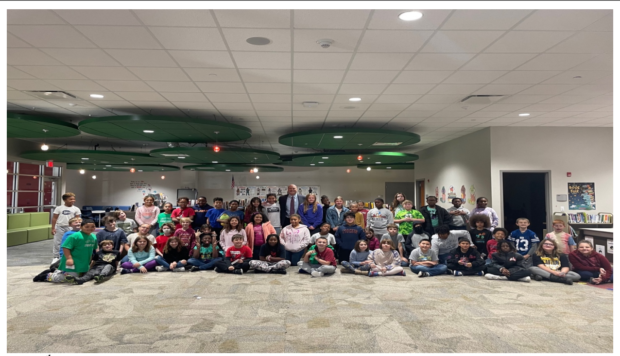
Our 4th Graders Enjoyed a Visit from Mayor Gahan. They Loved Learning about Government!